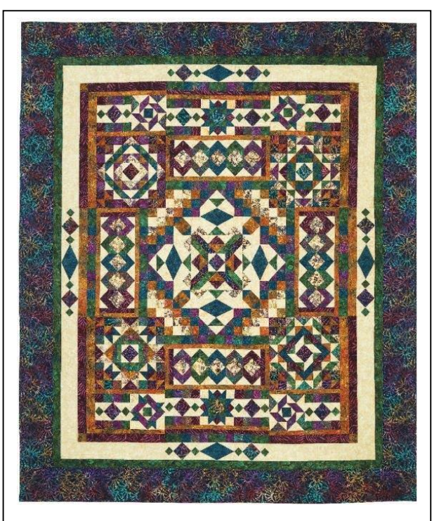
Gemstone - New Block of the Month